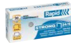
6 mm 2–30 sheets