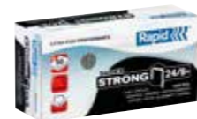
6 mm 2–30 sheets 8 mm 2–40 sheets 8,5 mm 2–50 sheets