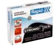
8.5 mm 2–50 sheets