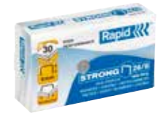
6 mm 2–30 sheets